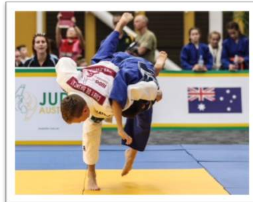
Gold Coast National Champs