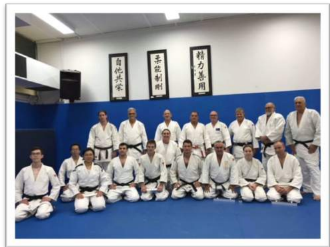
University Of Queensland St Lucia grading November