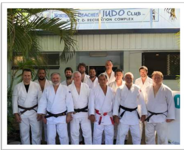
Northern Beaches Cairns grading mid year