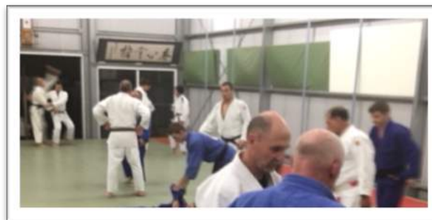
New Technical Education Courses